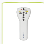
MA 1 handheld device